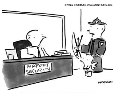
"He was trying to get on board with these."

What To Do When Your Inbox Is FULL Of Important Messages You Don't Want To Delete......Page 4