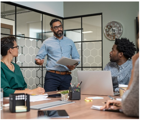
think things through and miss new opportunities that come along because they couldn't act quickly enough.

These leaders recognize that rapid growth is positive as long as they scale appropriately with formal organization and efficient processes. They are careful to avoid pushing forward blindly and losing essential parts of their culture and values along the way. However, they may take too long to